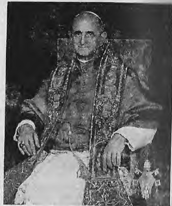
His Holiness Pope Paul VI, the Vicar of Christ

"Respect My churches and even more, the altars. Do not profane them! Let Christian women show themselves as such with their modesty, imitating My most holy Mother, Who is their model. Let them perform true atonement. Let the Penitential Rosary be prayed; it does not matter if the bishops do not approve it: I have dictated it.